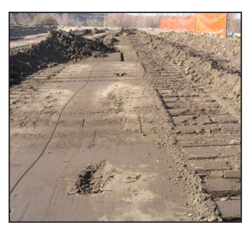
Conventional 3D System

Fine grading with a dozer has been typically done in first gear. Not anymore. Now you can move more material at higher speeds and at a tighter accuracy with one machine. That's the Topcon advantage.