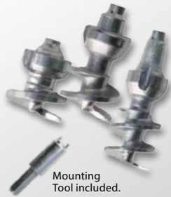
Mounting Tool included.

Visit valpar.ca for a full listing of sizes and styles.